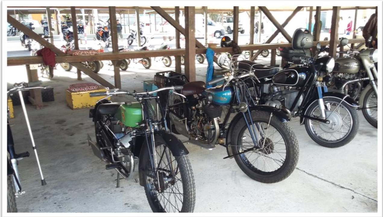
As can be seen there was some looking and thinking by our members.