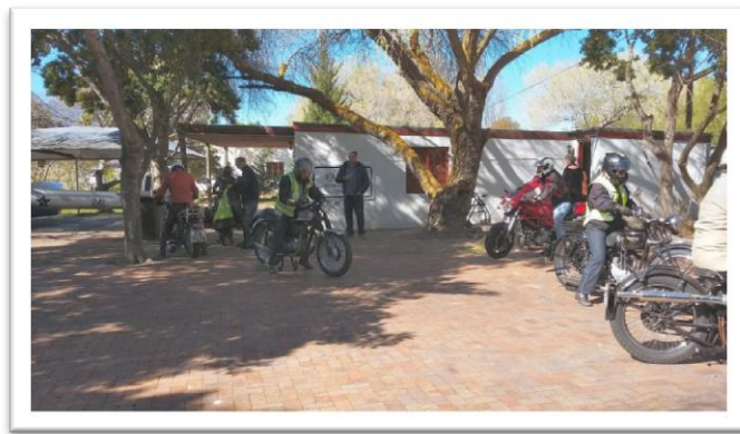
The weather was great, clear blue sky and no wind, a good selection of bikes arrived