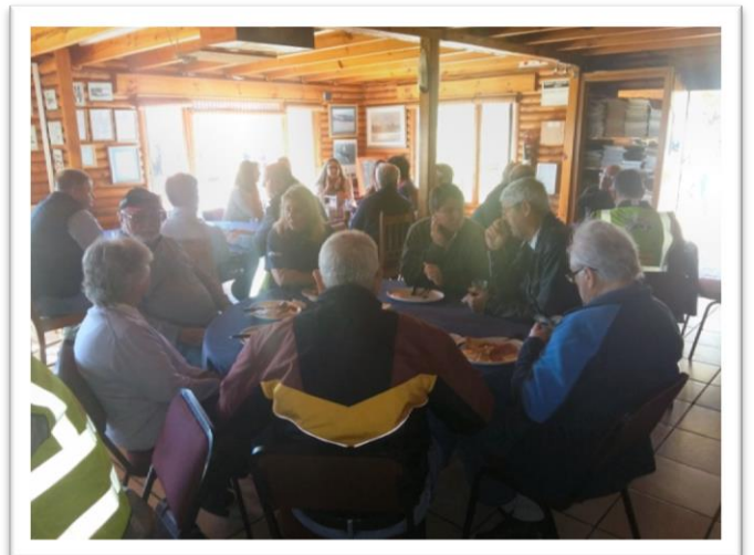
As usual a very good breakfast at a reasonable price was enjoyed whilst people caught up with the news