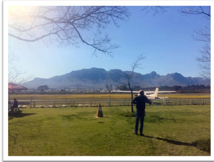
A stunning view from the restaurant