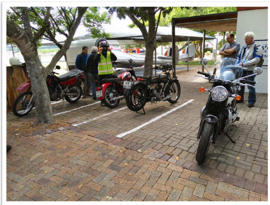
Lovely day for a bike ride, low wind & not too hot