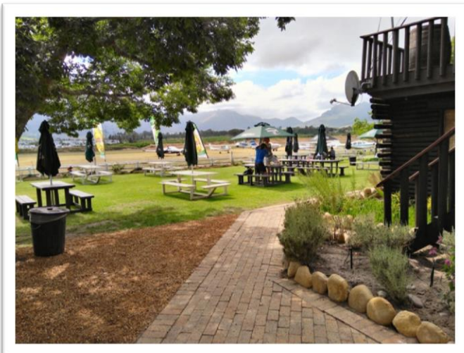
As usual lovely view across the airport

Breakfast was not up to the usual standard, it was a buffet, (which ended up cold, as most buffets do!) laid out in the “hanger”, but with the tea, coffee and cool drinks obtained in the bar. As can be seen the hanger is rather basic (rustic as one of the members said)