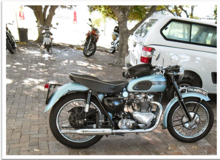
A good collection of bikes, on a sunny autumn day.