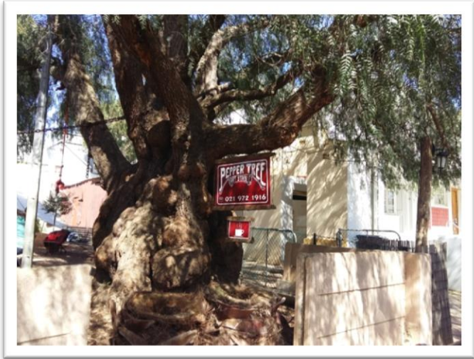
The breakfast was slow in coming but what a feast when it arrived.