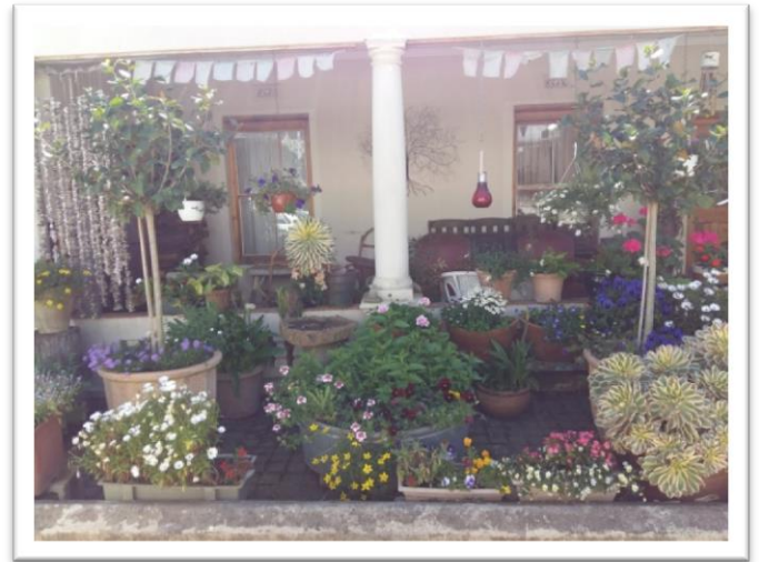
The whole area is worth a visit, the shops opposite give a good show.